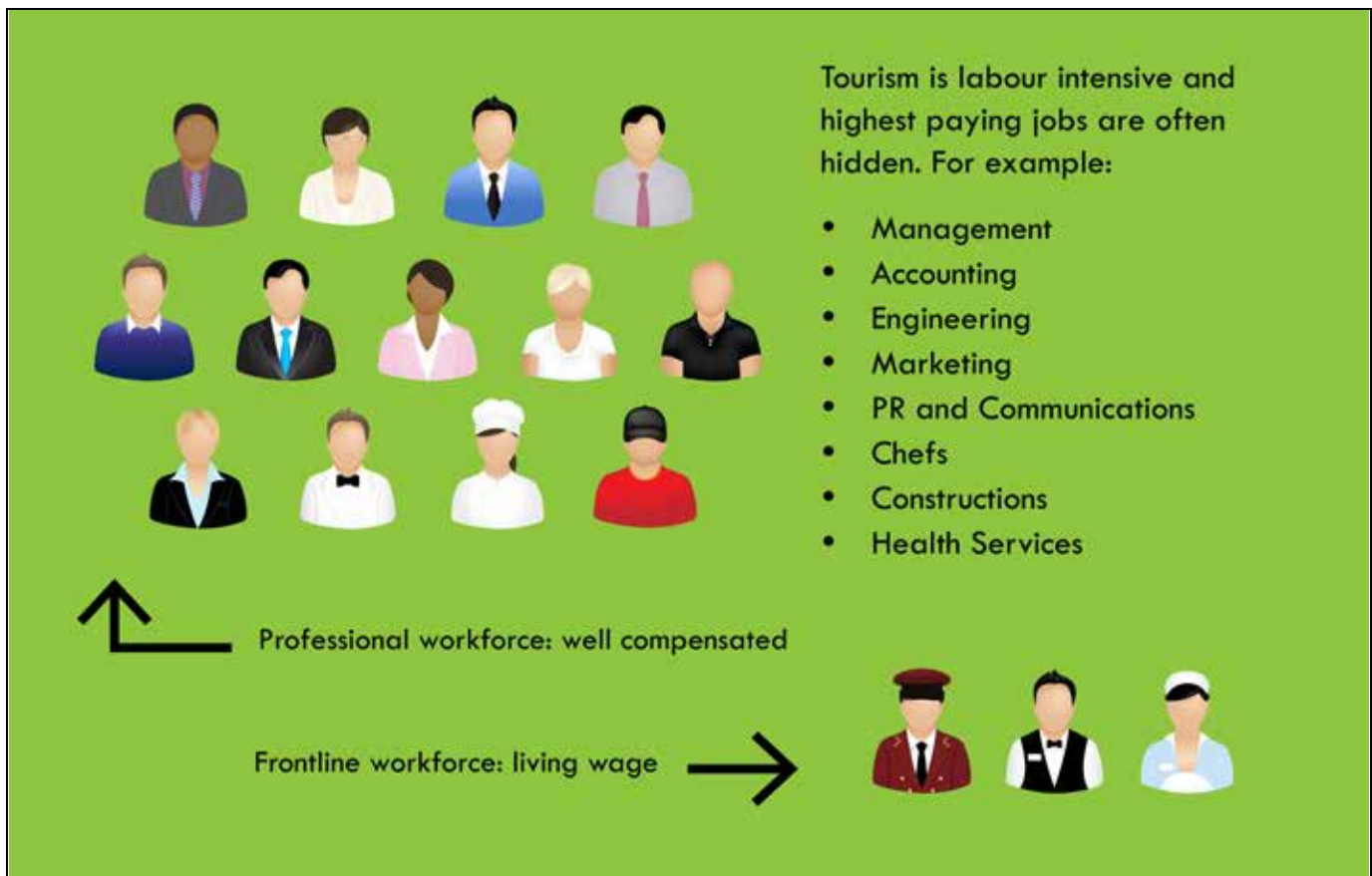
Tourism's Diverse Labour Force

Some of the objectives in this plan place specific emphasis on creating more demand through volume, which drives rate and working on seasonality. The clearest beneficiaries of these are the accommodation sector; however the benefits quickly spread throughout the economy to all our members. This is because a full and vibrant accommodation sector is the starting point of a healthy tourism ecosystem. If we have more customers in the destination spending time with overnight or stays of several days or longer all other sectors will benefit immediately from their patronage. A healthy tourism economy starts with enticing customers to make a commitment to stay and visit and then spend within the community. One cannot be achieved without the other.